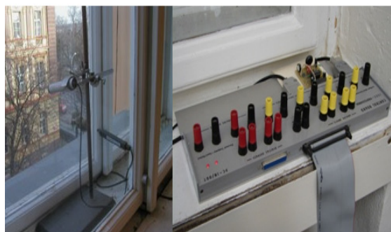
Figure 6 Experimental arrangement of the remote experiment "Weather station" in Prague, utilising an ISES set, www.ises.info