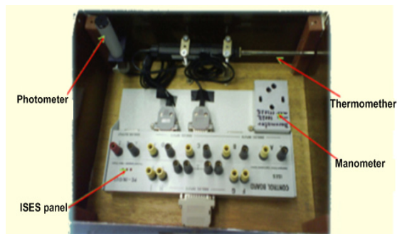
Figure 5 Experimental arrangement of the remote experiment "Weather monitoring" in Trnava, utilising an ISES set, www.ises.info

remote experiments and the server-client connection was modular ISES WEB Control software. The thermometer is protuberant form the window for about 20 cm (Fig. 6), the manometer is located inside the laboratory and the photometer is focused horizontally to the sky. In fact, the photometer is not a heliograph, as it does not collect sunshine from the whole hemisphere. The thermometer is partly shielded from the direct solar radiation.