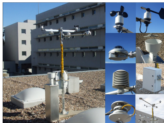
Figure 4 Weather station at the Faculty of Engineering, University of Porto [6]

Description of equipment: The weather station at the Faculty of Engineering University of Porto (FEUP) (Fig. 4) comprises an anemometer, a wind rose, pyranometer for measuring solar radiation, rain gauge, sensors for measuring relative air humidity, temperature and atmospheric pressure, and pyrgeometer for measuring the atmospheric infra-red radiation spectrum.